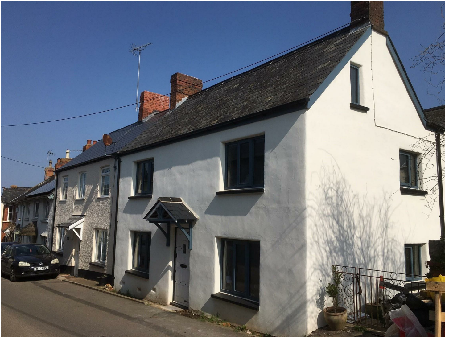
The Old Bakery